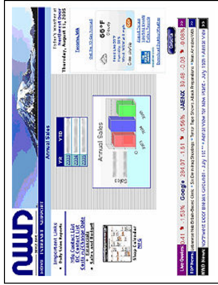
Northwest Door's new executive dashboard

mrc@mrc-productivity.com www.mrc-productivity.com